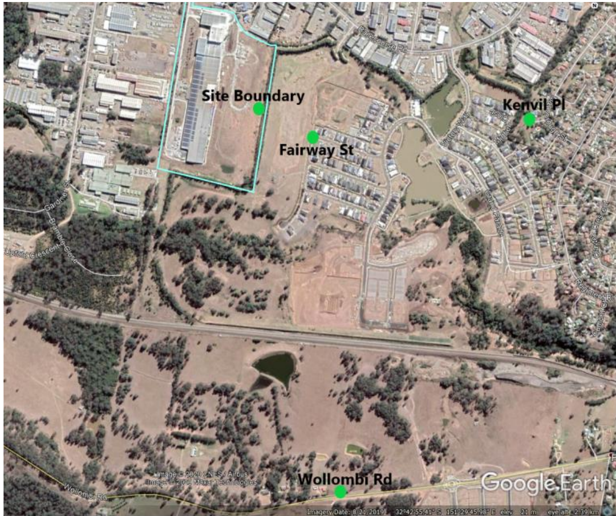
Figure 1 Site and Receiver Monitoring Locations

These monitoring locations are shown in Figure 1 along with the site boundary monitoring location.