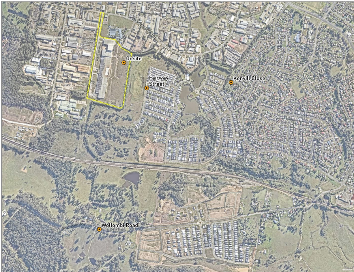
Figure 1 Site and Receiver Monitoring Locations

These monitoring locations are shown in Figure 1 along with the site source monitoring location.